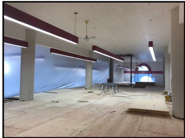
View from the south end of the mezzanine

As most of you know, we ran into a couple of snags underground at the beginning of our project. I am happy to say that we are now above ground and things are really moving along. As you can see in these pictures, the floor of the mezzanine has been laid, the elevator is framed and staff are working around a plethora of stuff, but getting the job done. We appreciate the patience and excitement from you, our community, and we can't wait to unveil our beautiful new mezzanine! (see additional pictures at end of the Newsletter)