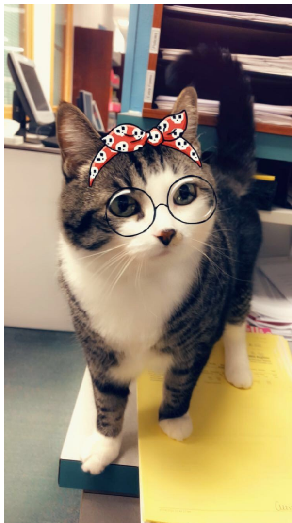
Mikey strikes a pose!!!

To learn more about how you can become involved with the work of the foundation, stop by the library.